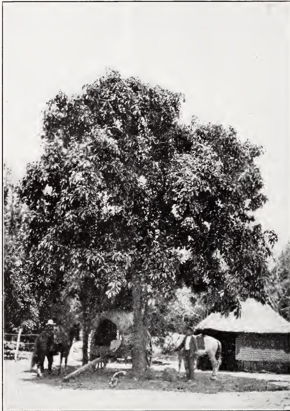
Tree from Which "Knight" Buds Were Taken, in Guatemala.